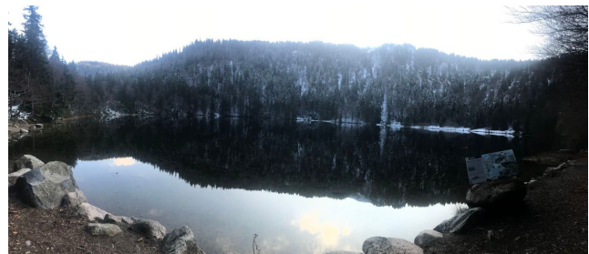
Hiking experience in Feldberg