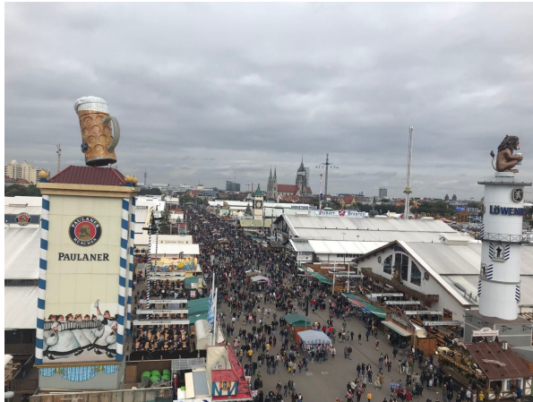
Top view inside the carnival

I went to Munich with my friend during the Oktoberfest time. It was a great way to experience Bavarian culture and immerse ourselves into the carnival atmosphere.